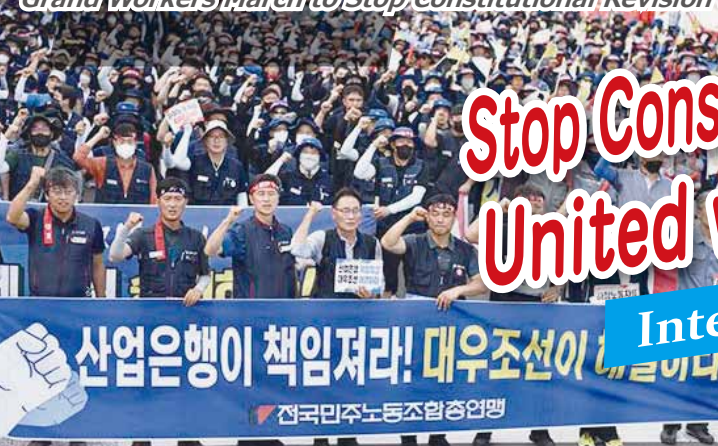
Photo.;Above: November rally in 2021 Left: KCTU rally in solidarity with the shipbuilding workers' strike Below left: People of Myanmar in Japan protesting against Abe's state funeral Below right: Strike & demo protesting against prices surge (England)