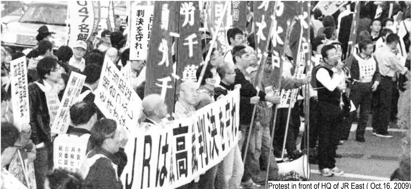
Protest in front of HQ of JR East ( Oct.16, 2009)

Stop massive unemployment! Revive militant labor movement!