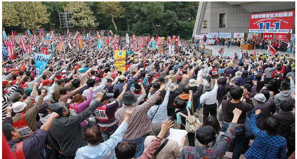
International Workers Solidarity Rally (Nov. 1, 2009)

Absolutely No to Doshusei (Wider Area Local Government System)—privatization and firing of 3.6 million public workers!