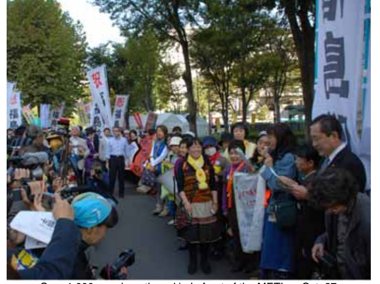
Over 1,000 people gathered in In front of the METI on Oct. 27

We'll call on you women deeply minding the same; Let's get together and link arms!