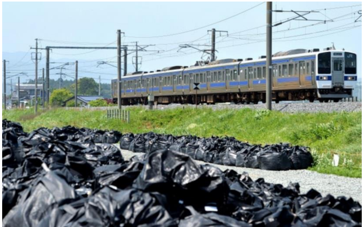
Test operation between Hirono Station and Tatsuta Station; innumerable radioactive waste in flexible container bags are piled up on lands adjacent to the rail truck.

governmental scheme. What an outrageous deed!