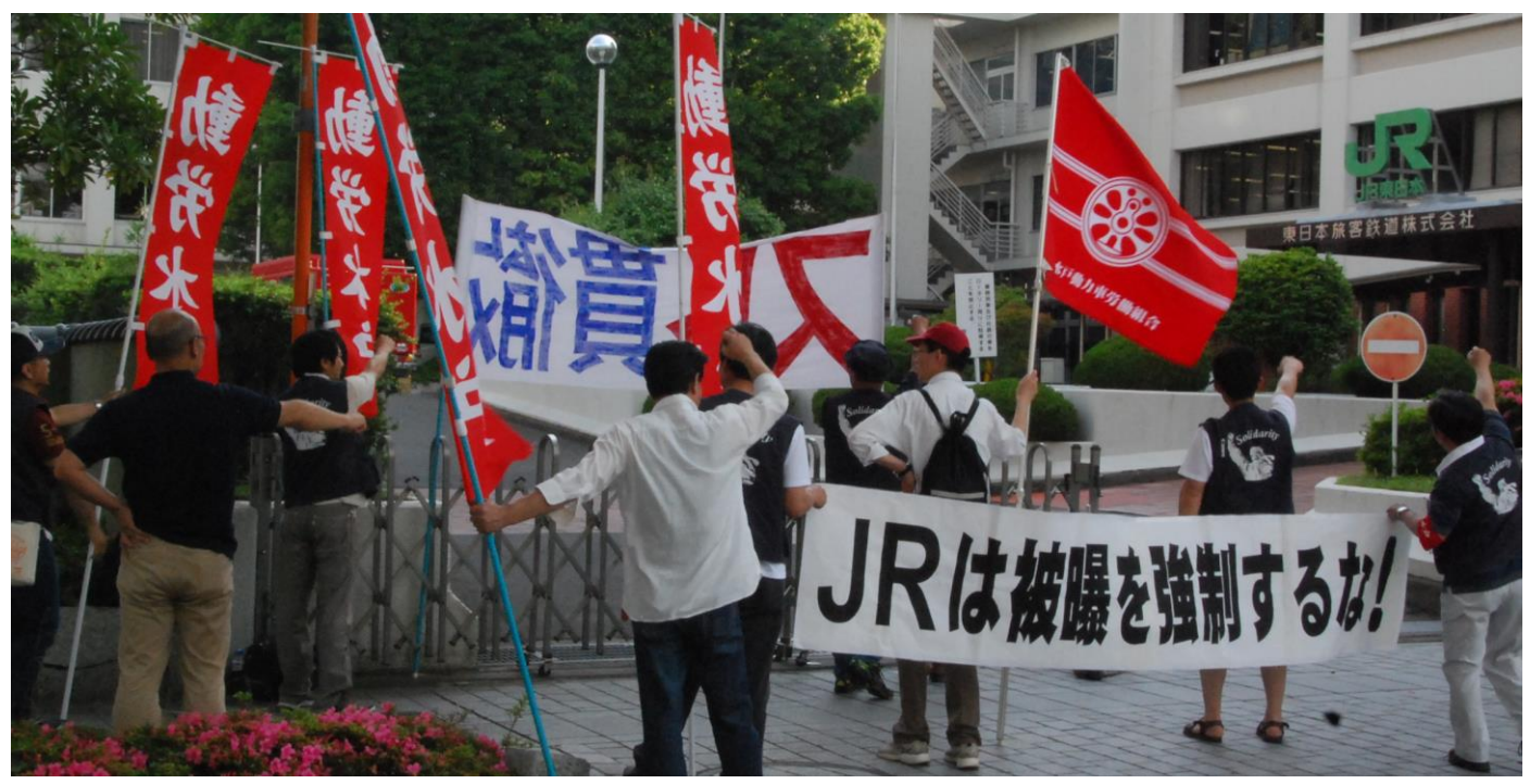
Striking Doro-Mito members (May 31, in front of Iwaki Transport Bureau of JR East)

Secretary General of National Conference for Worldwide Immediate Abolishment of All Nuclear Power Plants (NAZEN)