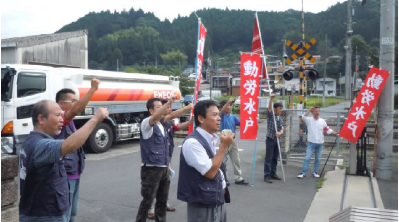
protest action in front of Daigo Transport Facility, July 30