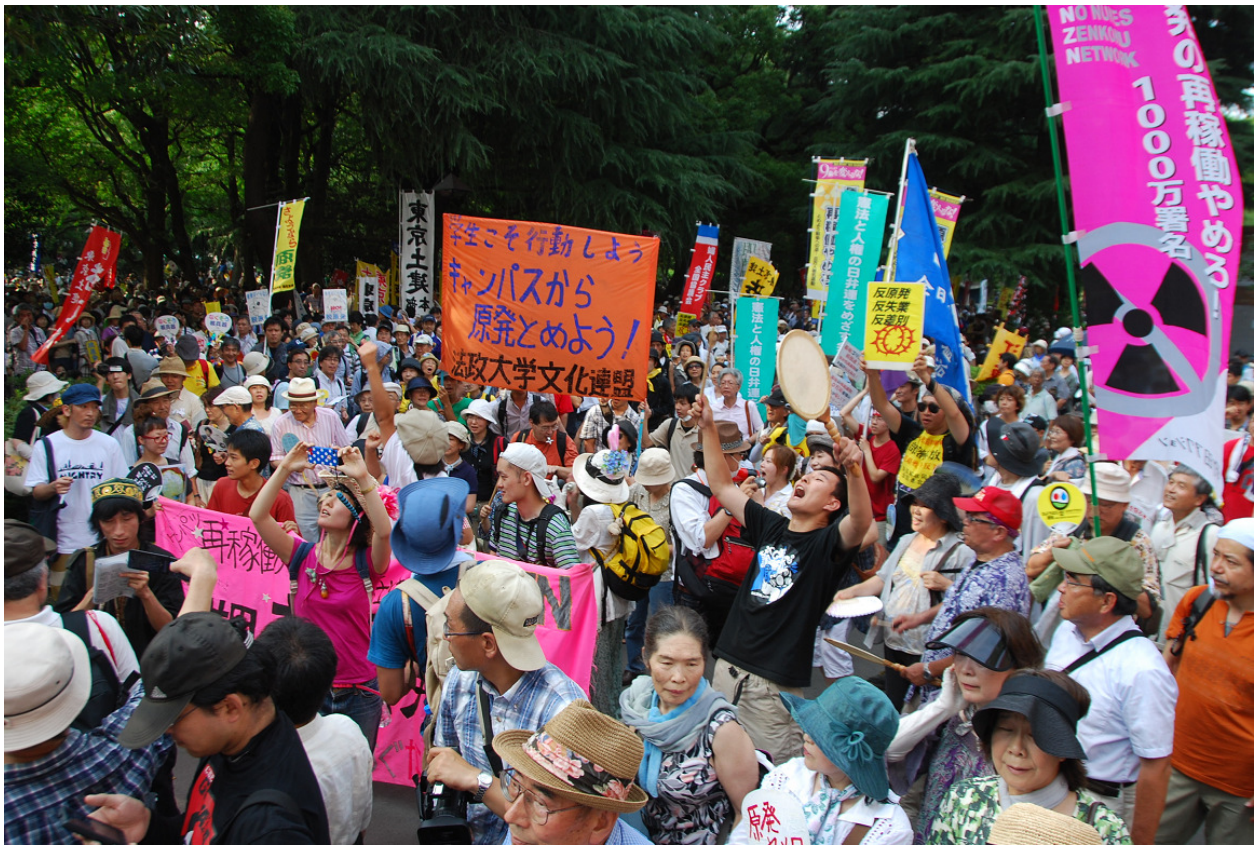
Nazen contingent in Hibiya Park before the march to the Parliament, July 29