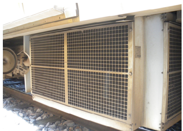
Radiator of a diesel locomotive used in Suigin Line

they cynically refuse to take even some mitigating measure for people in Fukushima, but expose JR workers to the same amount of radiation.