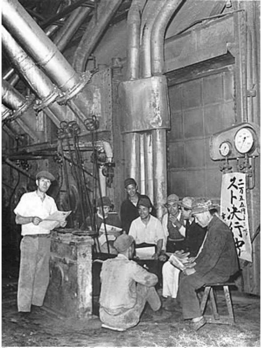
Electrical workers on strike in Tsuruimi Thermal Power Plant, September 1952 Densan Union organized whole electric power workers including subcontract workers.

undermined and destroyed the labor right and unity of workers in the name of capitals' "freedom", and demanded the abolition of regulation on capital's movement in quest of profit under the protection of the state power. Workers' right and social security system, which were obtained by class struggle in the post-war upheaval, became target of neo-liberal offensives due to the drastic policy change of Japanese imperialism in the last half of 1980'. Its aim