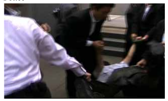
Police brutality in the High Court

Outrageous repression on Farmers Struggle by Tokyo High Court and Tokyo Metropolitan Police