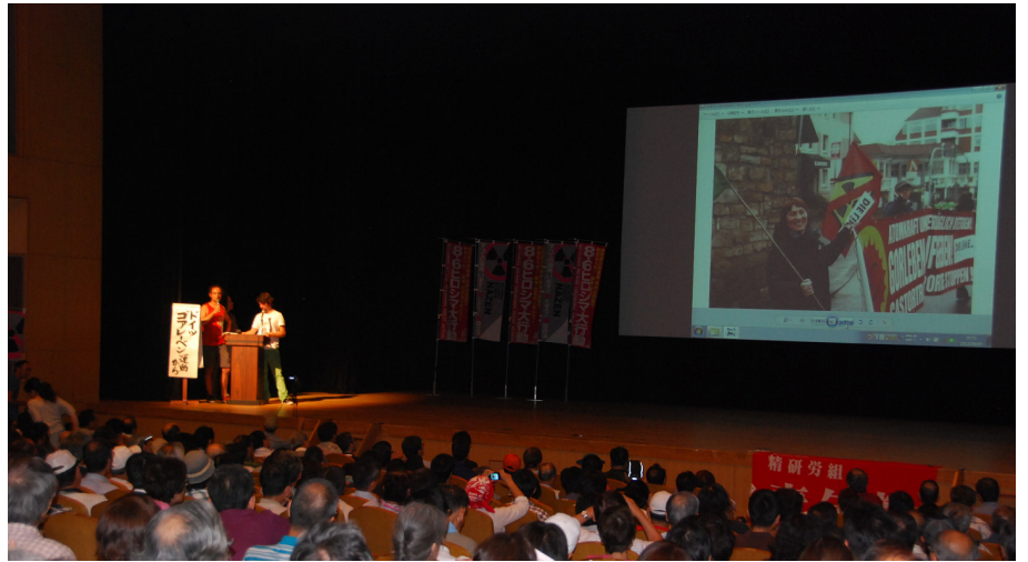
A young man from Germany spoke about the struggle against the planned construction of Nuclear Waste Final Disposal Site in Gorleben and the protest action against Grohnde Nuclear Power Plant. "The nuclear mafia is everywhere in the world." "International unity and solidarity is indispensable."